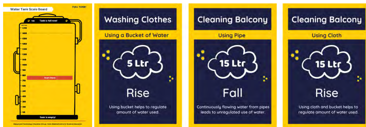
Figure 2: Game board (left) and water activity cards (right) of the Full Tank game.

Water tanks are used as a common storage option in many Indian households. The idea behind having a tank depicted as a representative scale, is to indicate that water though renewable is something that can become scarce and at times get exhausted. The scale tries to show that various human activities, as depicted in the ‘Water Activity Cards’ can have positive or negative effects on the water level. The daily chores/activities of the household are presented on cards with which the game is played, and alternative water usage options are given for the same chores. For instance, for a “Cleaning” task there are two options provided, one which results in water wastage (using a hose/pipe) and the other which helps in using less water (using a mop). Thus, water consumed while doing various activities affects the water level on the water tank. These fluctuating water levels in turn gives an opportunity to the players to assess which activity may preserve or waste water. The elements of the game are discussed below (Figure 1):