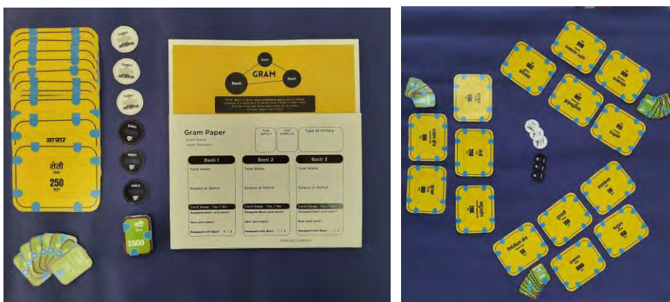
Figure 4: Game elements of the “Gram” game

The understanding of water as a resource broadens from an individual’s consumption to community sharing and distribution, as one moves up from the lower to higher grades. Details such as different sources of water, its ever-increasing consumption and distribution systems are elaborated. Building on the basics of community sharing of water, cooperation, and water sustainability, another game titled” Gram” (meaning society/village) has been conceptualised where a hypothetical village is to be provided water and the challenge is to make the village water distribution efficient via players cooperation and strategy. The elements of the game (Figure 3) are discussed below: