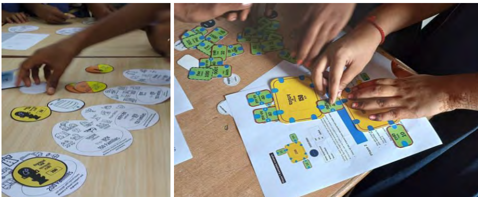
Figure 5: Paper prototyping the game ‘Gram’ and testing with students.

User testing and evaluation: The game is currently in the evaluation stage and is being play tested with secondary school students (Figure 4). The principles and dynamics of the game are unique for Indian classrooms and need careful testing and analysis for it to be an effective learning aid for students.