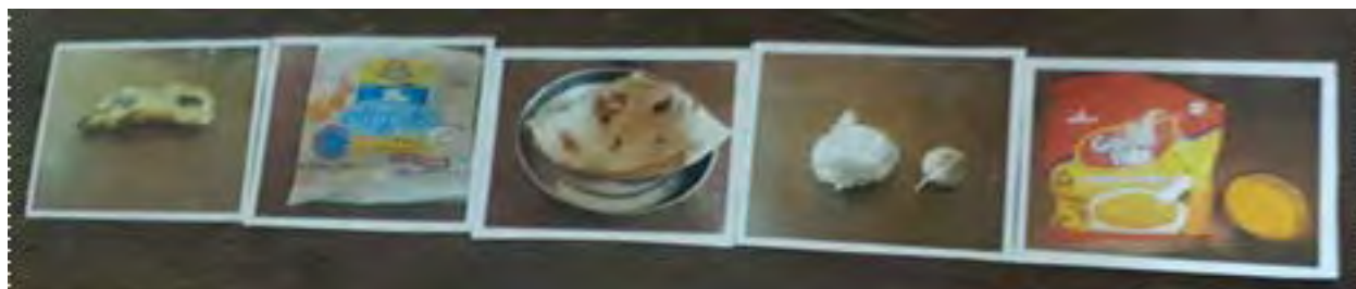
Figure 1: Representative arrangement of picture cards depicting various food items.

The graph (Figure 2) indicates responses from various groups on the positioning of the food items. According to the graph, most groups indicated banana at the 1 st position, suggesting that it can spoil first among the given items.