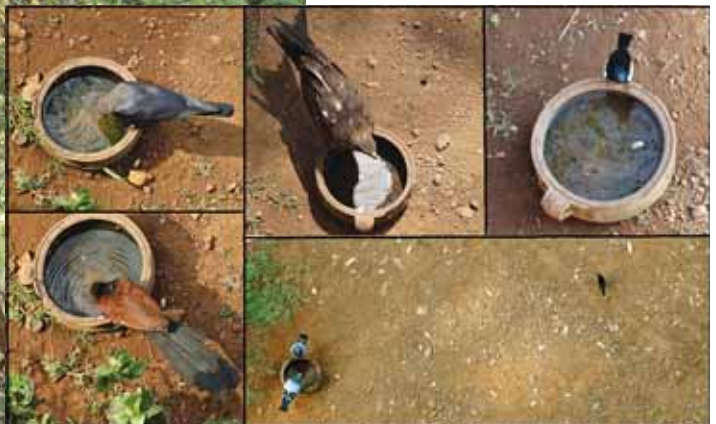
Thirsty birds in summer, Mumbai.