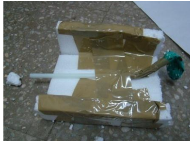
Fig 5: Actual model of PDA rocks

in air the artifact is put in water and air from balloon is released making the artifact go forward in water.