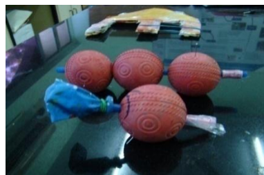
Fig 3: Actual model of science brain

Actual model: The material they used was rubber balls. The basic design was to drill holes in 4 rubber balls and pass a straw with a balloon attached at one end through it. The group was very confident that the toy would move on water. Though lot of questions were asked regarding the possibility of toy not working or sinking of balls or tilting but the group was adamant on their stand that it will work hence they were given the freedom to make it