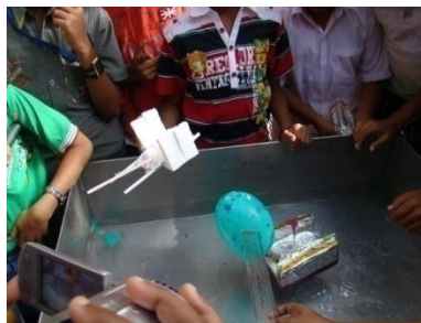
Fig 6: Actual Model made by triple tornado

Actual Model: The arrangement had ice cream sticks arranged in vertical and horizontal rows with straws on either side. However from the design it is not clear as to how the artifact would move forward. They later modified the design. The mechanism was that as air is filled in the balloon and the structure is kept on water due to air release the artifact would be propelled forward.