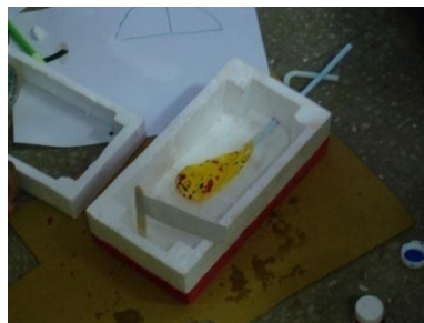
Fig 1: Actual model of 3 stars

The group had planned to make the toy with thermocol keeping in mind the floating sinking activity. The design was simple so group finished the task quite early and spends rest time either testing the boat or decorating it with thread and toothpicks. This was the first group to test the boat.