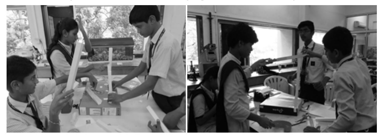
Figure 2: Left- The girl gestures to her group members, the ideal height of the second pillar (G6); Right- Students move the free-track up and down to check for the right incline, before sticking it to the pillar (G11).

Modelling and collaborative designing: During collaborative designing, design ideas become visible for joint evaluation and development through materialisation and model making (Ramduny-Ellis, Dix, Evans, Hare, & Gill, 2010). Prototyping can be used as an effective method to externalise ideas that might otherwise be difficult to imagine, explicate and verbalise (Yrjönsuuri et. al, 2019). In this section, we showcase instances of how a shared goal of co-creating an RC model encouraged collaboration between group members through material handling, and making and assembling parts of the RC model. In this section, we elaborate on two important aspects of collaborative designing. One was the distribution of tasks and responsibilities and the second was the use of verbal and non-verbal modes of communication. The task of making a working RC in a group within time constraints and the material manipulation and assembling required a lot of coordination and teamwork. Lahti, Kangas, Koponen, and Seitamaa-Hakkarainen (2016) have reported linkages between model making and materials with division of labour. Particularly, we observed instances where a student was involved in a making task, and either requested help or was offered help to achieve the task (G5, G11). In most of the groups, leaders emerged implicitly or explicitly, and delegated responsibilities, built a consensus among team members and steered the group closer to their final design.