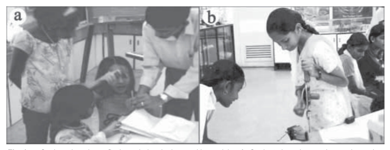
Fig. 1. a. Students learning to fix rivets during the bag-making activity. b. Student observing another student using a drilling machine

one member of this group, moved around to see how other groups were making their blades and observed a windmill model whose blades were bent at an angle (to trap air) and were moving swiftly. The member went back to her group and modelled her windmill's blades according to what she had seen and this time the windmill model of her group worked properly.